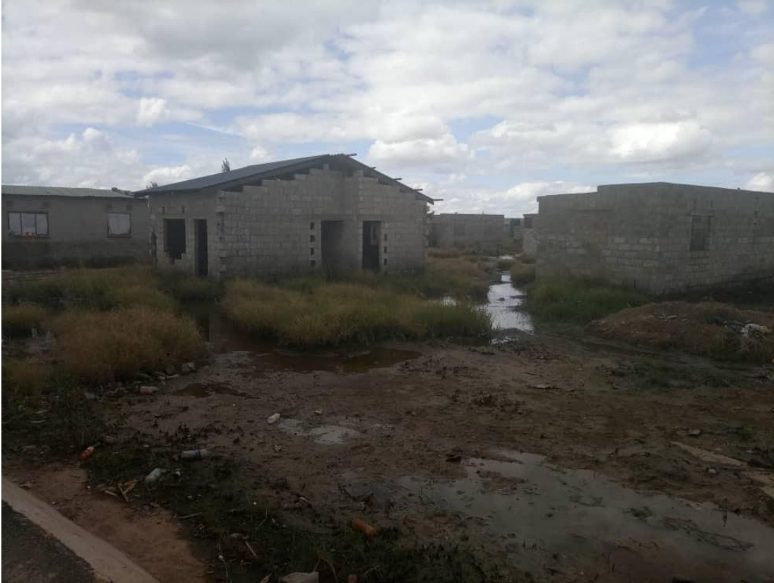
Annex 1: Pictures from the area showing latrines, incomplete structures and flooding