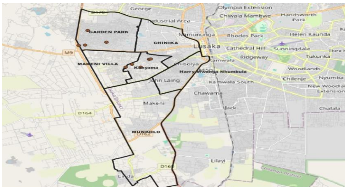
Figure 3: Distribution of cholera cases by PAMI ward in Kanyama constituency, Lusaka